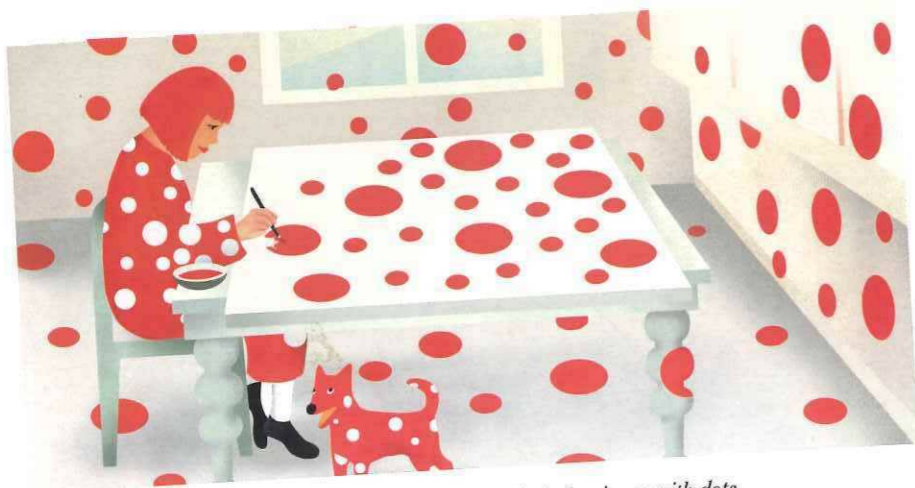
"I wanted to predict and measure the infinity of the unlimited universe with dots. Dots. How deep is the mystery? Is there unlimited infinity beyond our own universe? By exploring these questions, I wanted to delve into this unique dot that is my own life. One dot. A unique particle between billions." Yayoi Kusama on Yayoi Kusama