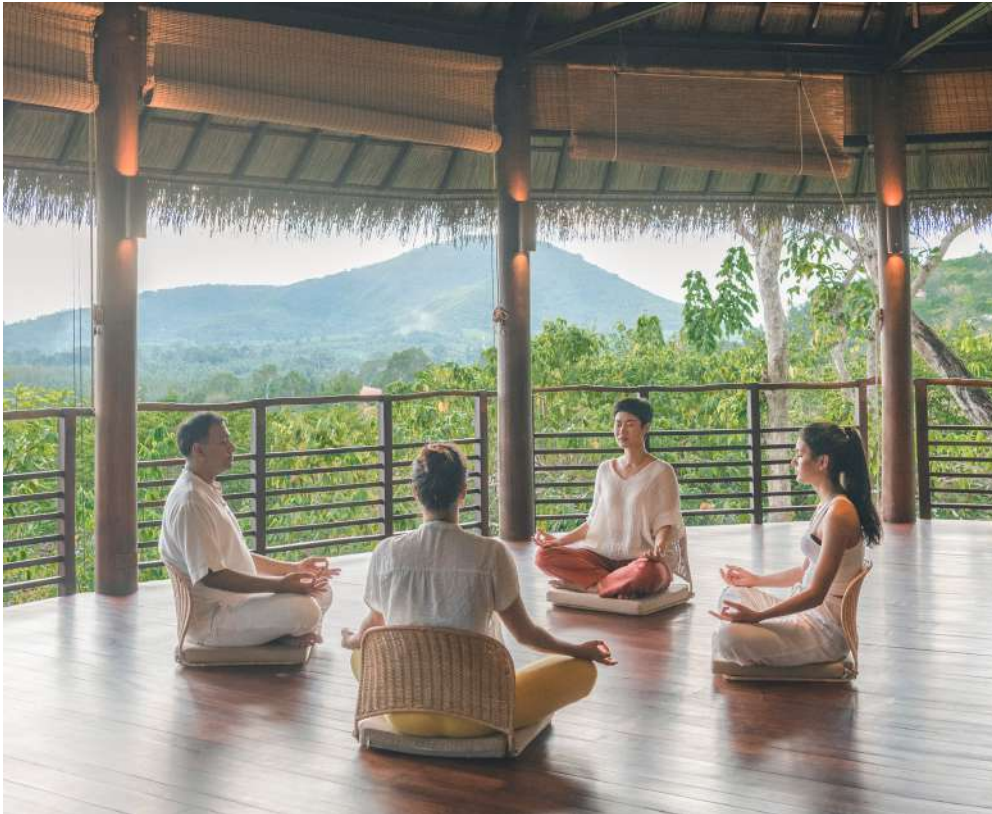
Above: meditation is part of the approach to healing at Kamalaya Wellness Sanctuary